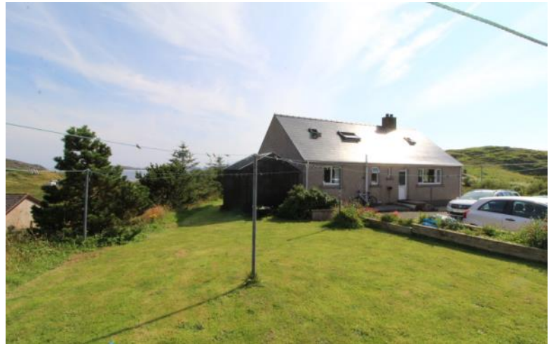
Rear Aspect and Garden