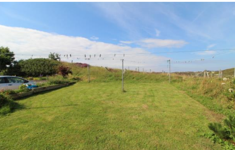
Rear Garden Grounds