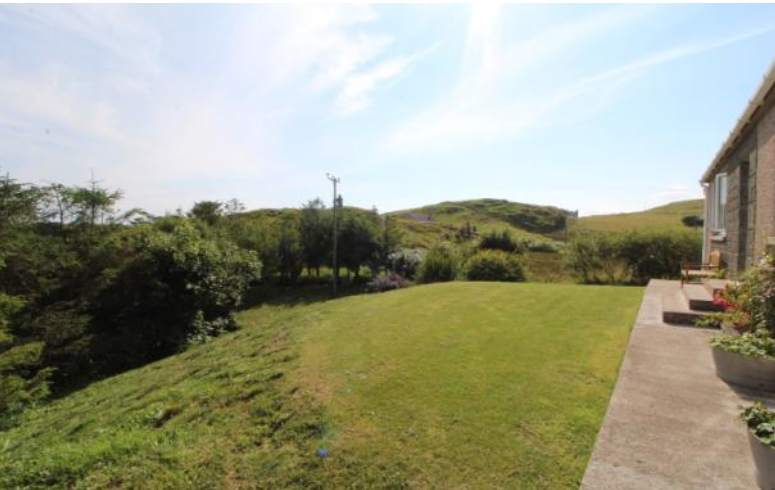
Front Garden Grounds