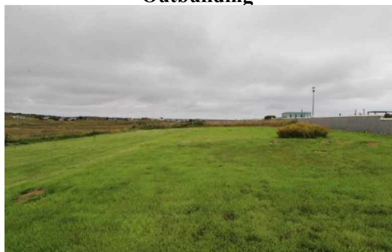
Rear Garden Grounds