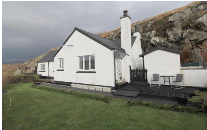
Side Aspect and Garden Grounds