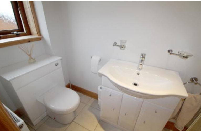
Bedroom 1 en-suite shower room