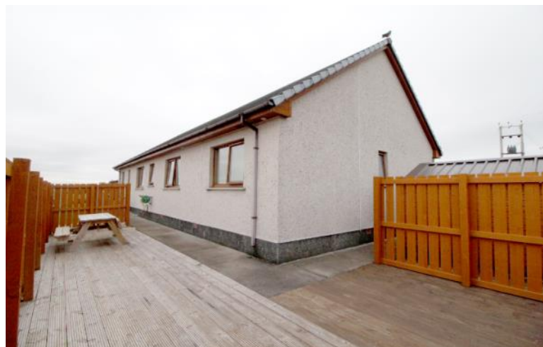
Rear Aspect & Decked Area